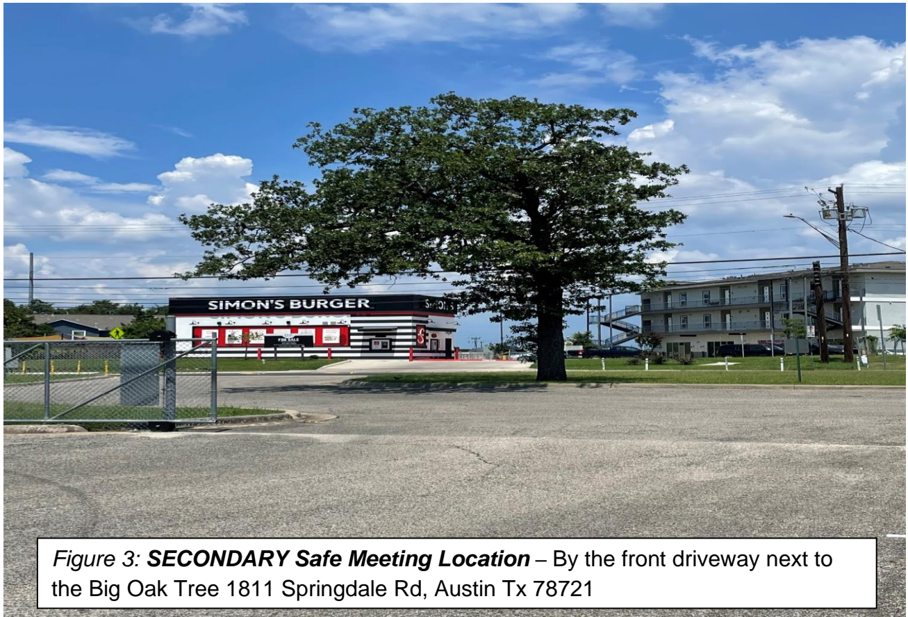
Figure 3: SECONDARY Safe Meeting Location – By the front driveway next to the Big Oak Tree 1811 Springdale Rd, Austin Tx 78721