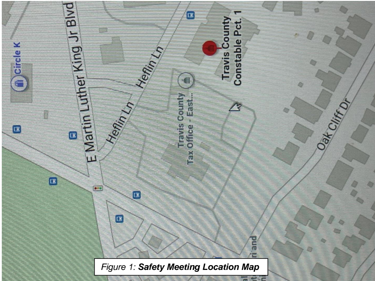
Figure 1: Safety Meeting Location Map