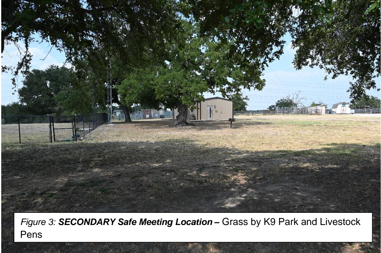
Figure 3: SECONDARY Safe Meeting Location – Grass by K9 Park and Livestock Pens