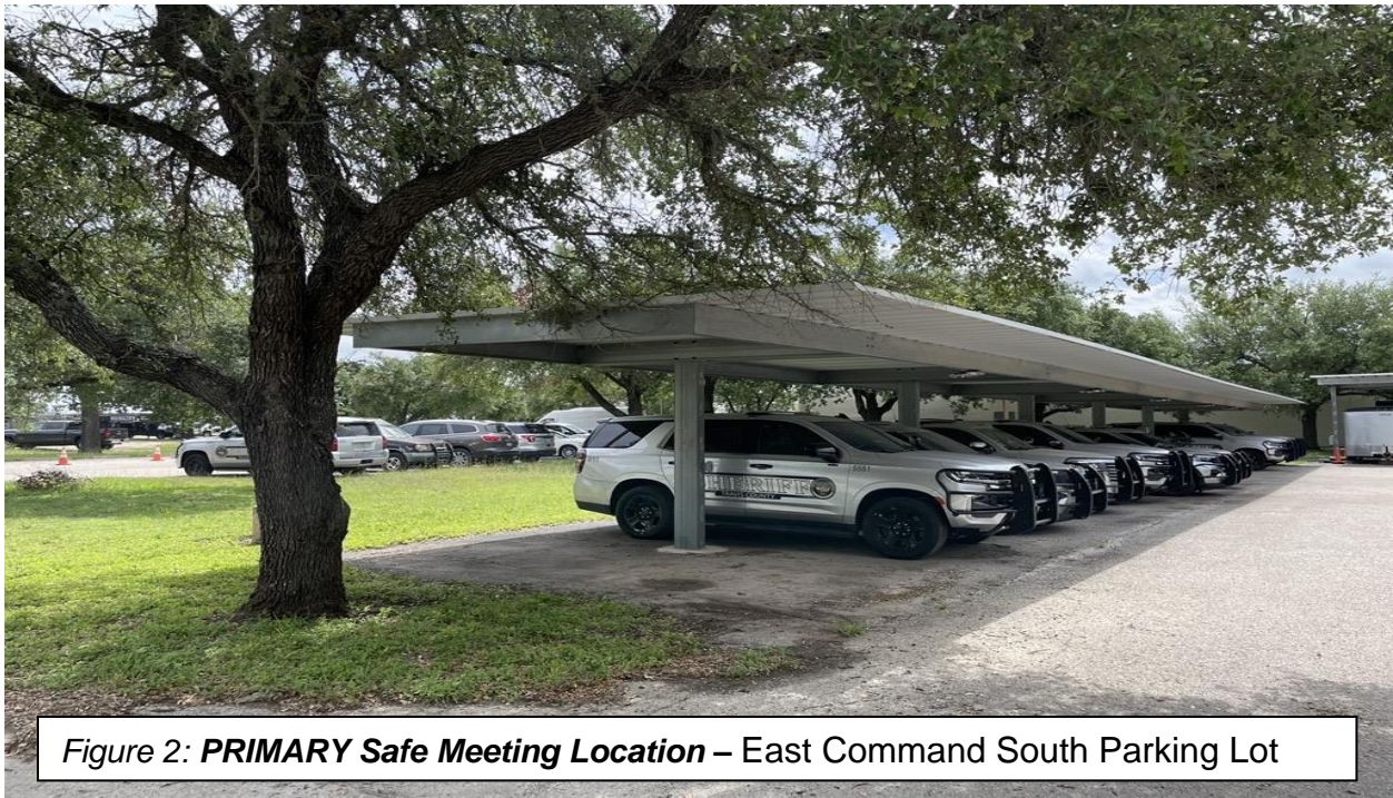
Figure 2: PRIMARY Safe Meeting Location – East Command South Parking Lot