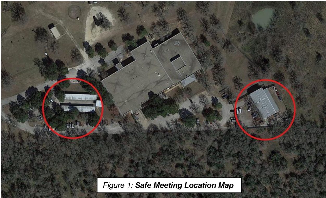
Figure 1: Safe Meeting Location Map