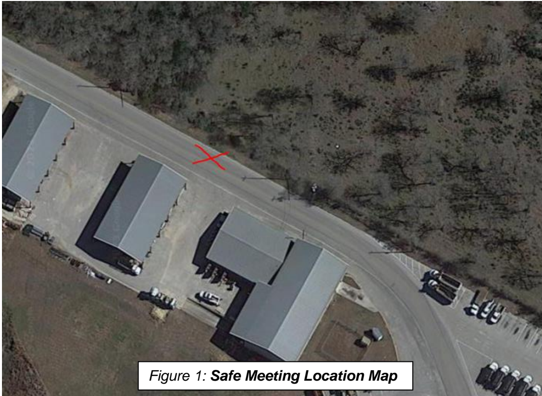
Figure 1: Safe Meeting Location Map