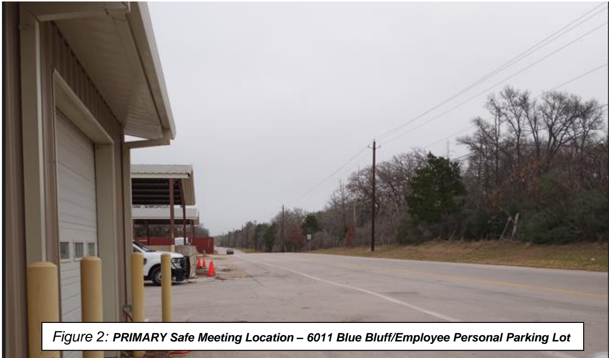
Figure 2: PRIMARY Safe Meeting Location – 6011 Blue Bluff/Employee Personal Parking Lot