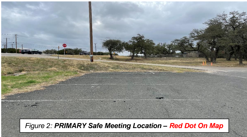
Figure 2: PRIMARY Safe Meeting Location – Red Dot On Map