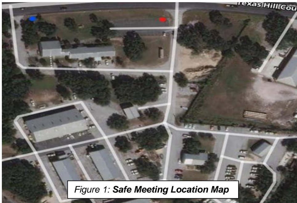
Figure 1: Safe Meeting Location Map