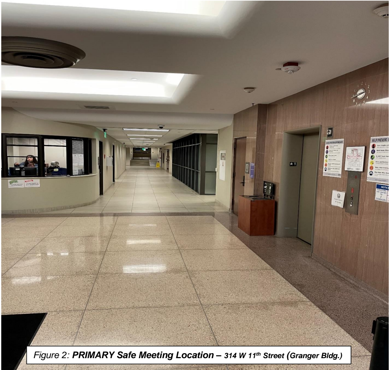
Figure 2: PRIMARY Safe Meeting Location – 314 W 11 th Street (Granger Bldg.)