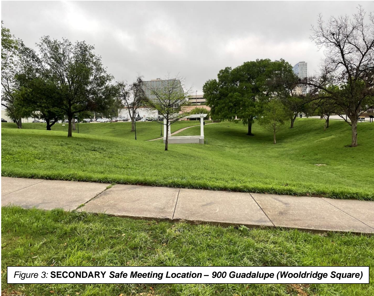
Figure 3: SECONDARY Safe Meeting Location – 900 Guadalupe (Wooldridge Square)