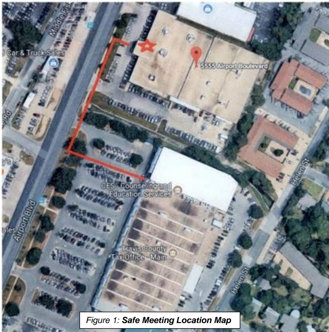
Figure 1: Safe Meeting Location Map