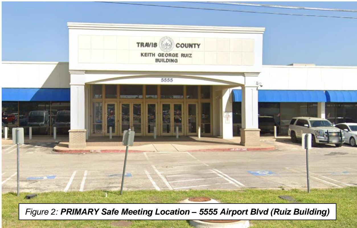
Figure 2: PRIMARY Safe Meeting Location – 5555 Airport Blvd (Ruiz Building)