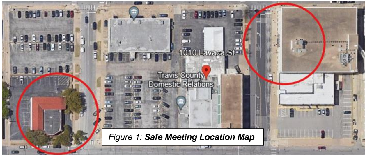
Figure 1: Safe Meeting Location Map