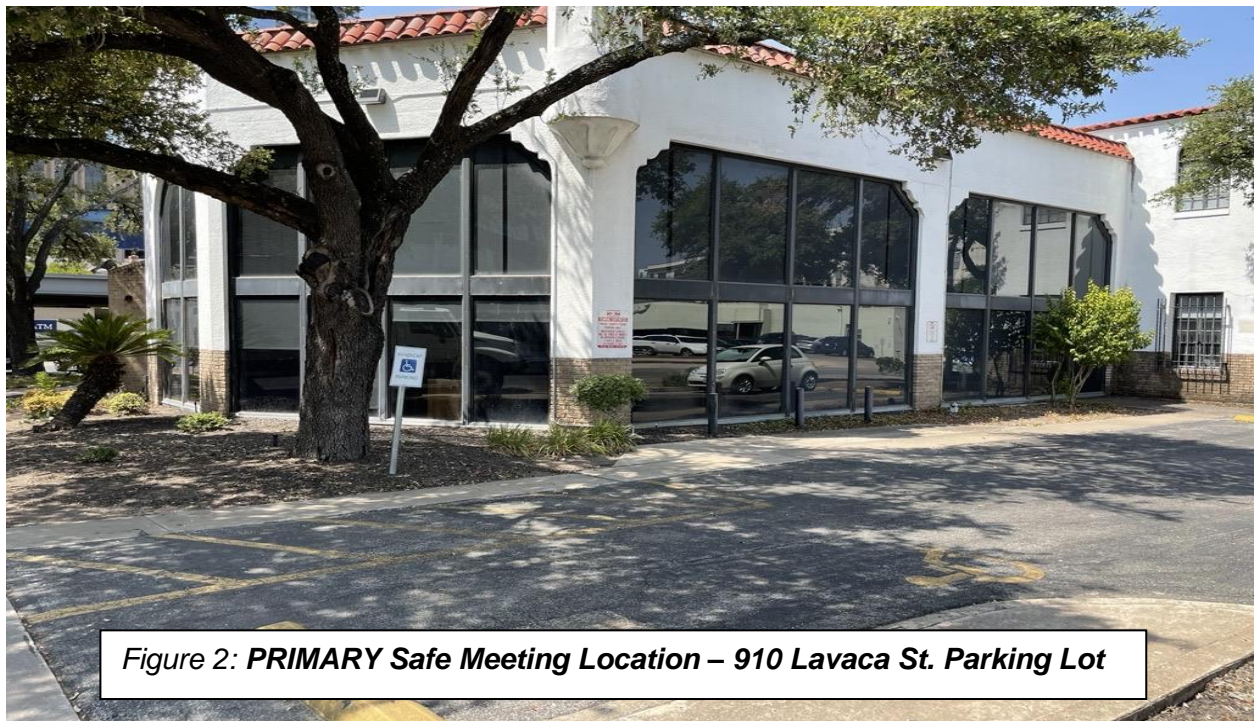
Figure 2: PRIMARY Safe Meeting Location – 910 Lavaca St. Parking Lot