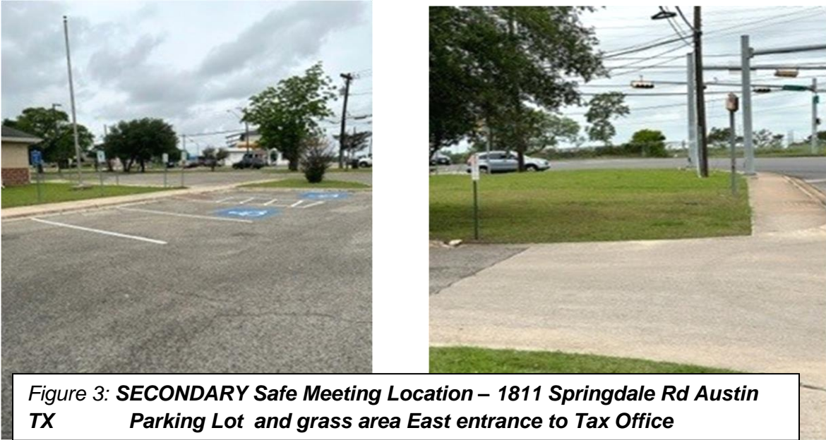
Figure 3: SECONDARY Safe Meeting Location – 1811 Springdale Rd Austin TX Parking Lot and grass area East entrance to Tax Office