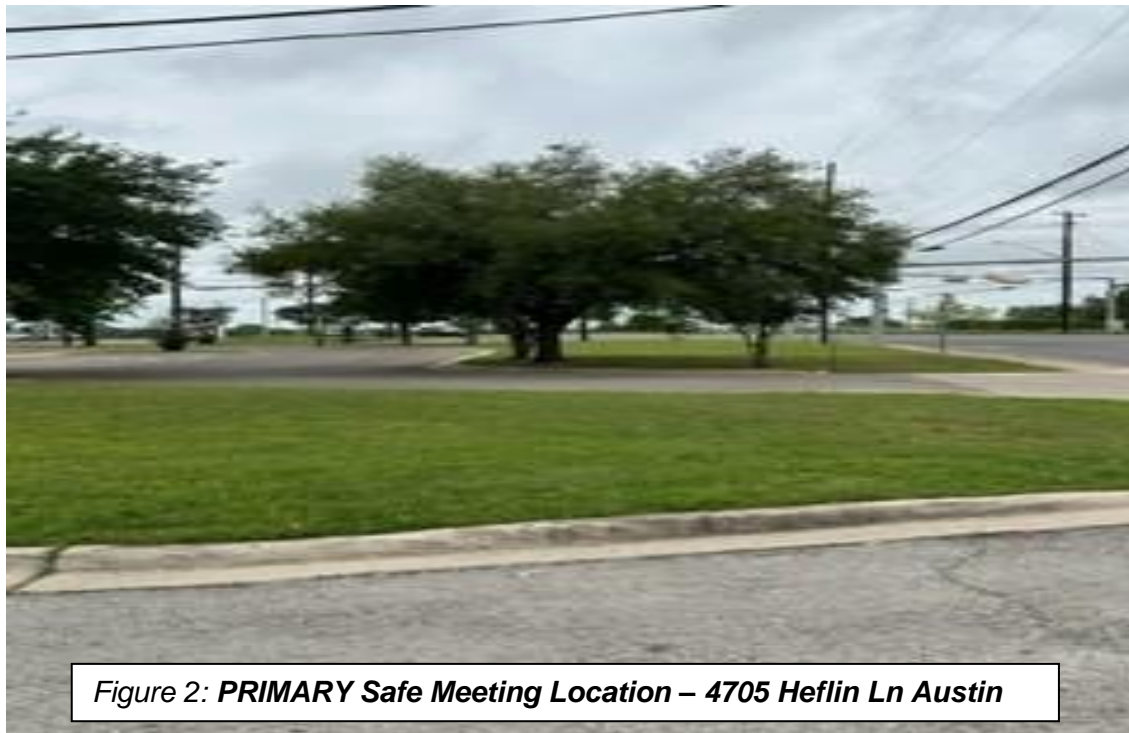
Figure 2: PRIMARY Safe Meeting Location – 4705 Heflin Ln Austin