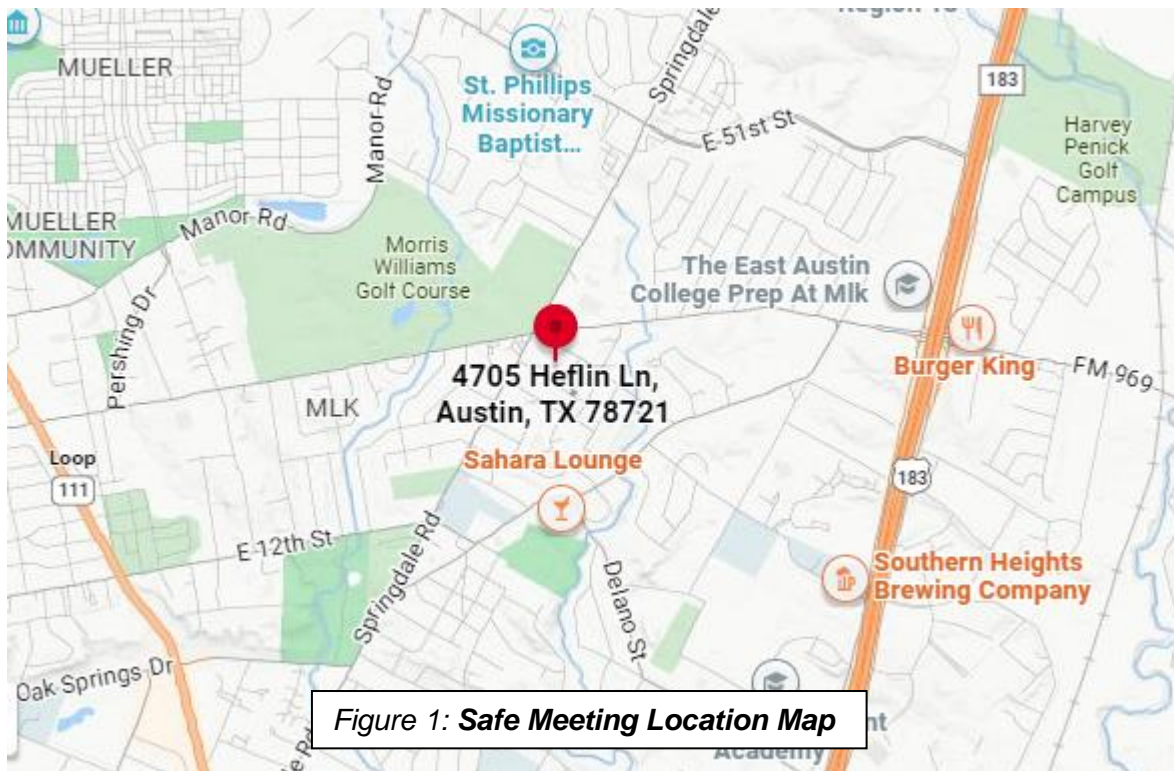
Figure 1: Safe Meeting Location Map