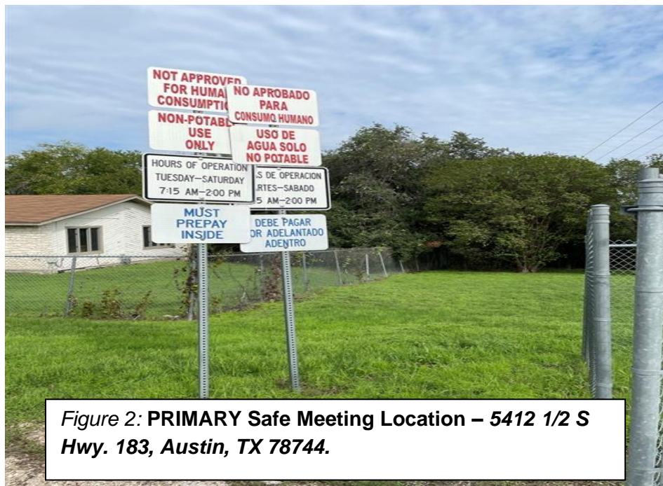
Figure 2: PRIMARY Safe Meeting Location – 5412 1/2 S Hwy. 183, Austin, TX 78744.