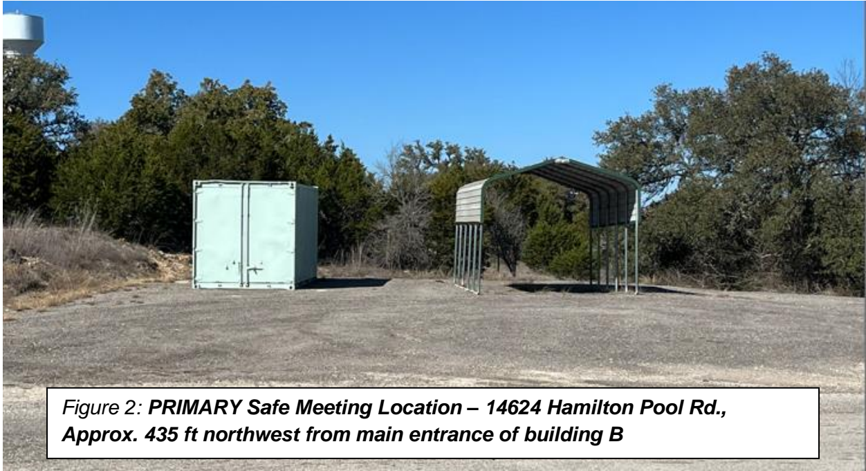
Figure 2: PRIMARY Safe Meeting Location – 14624 Hamilton Pool Rd., Approx. 435 ft northwest from main entrance of building B