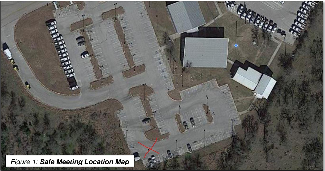
Figure 1: Safe Meeting Location Map