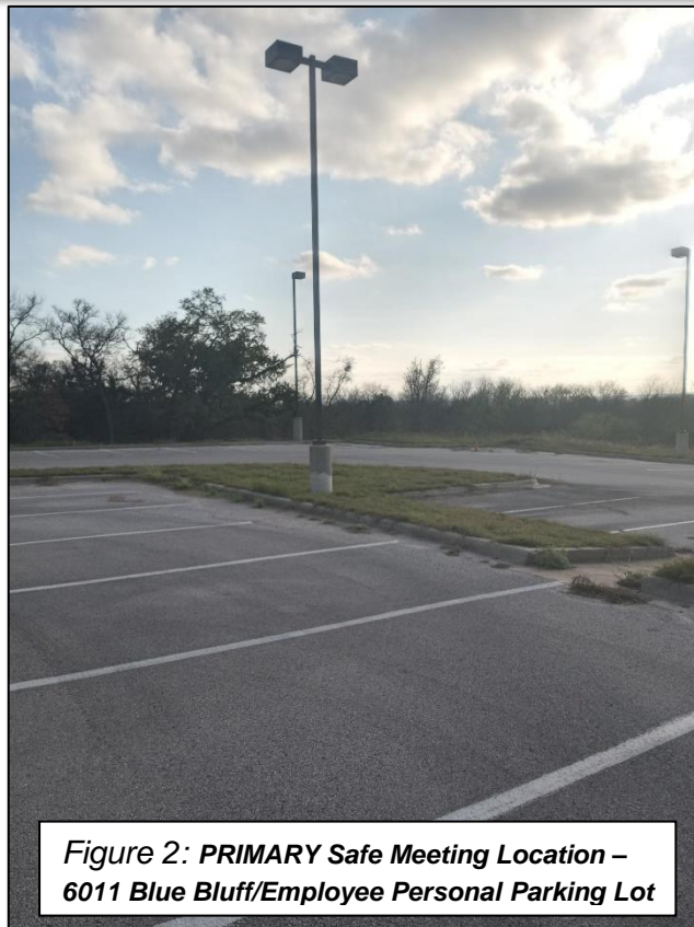
Figure 2: PRIMARY Safe Meeting Location – 6011 Blue Bluff/Employee Personal Parking Lot