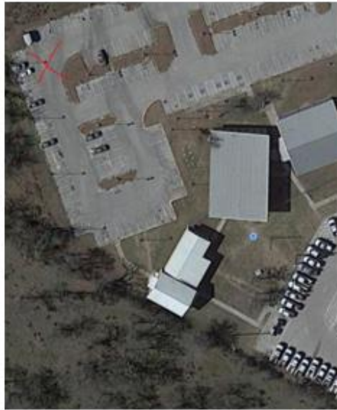
Safet Meeting Location