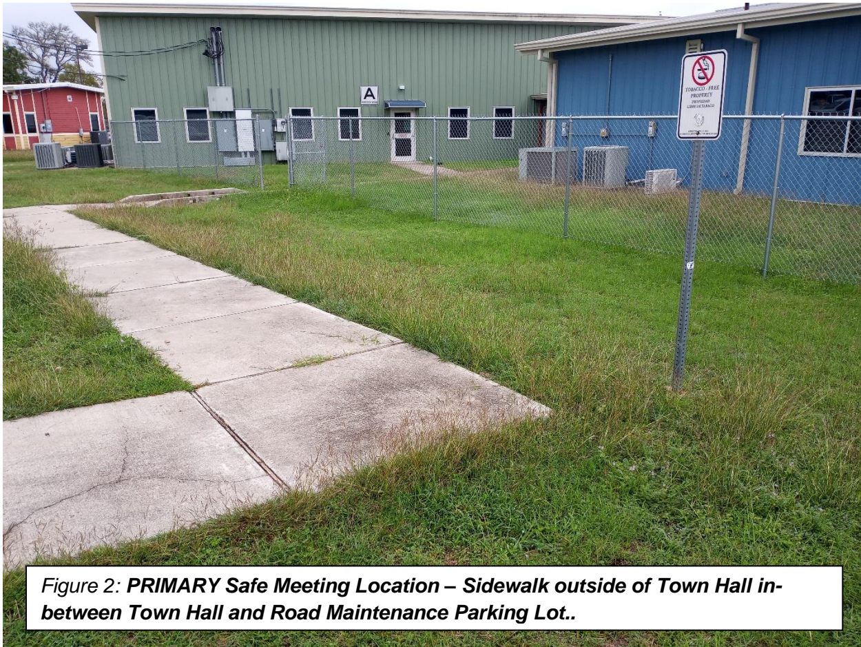
Figure 2: PRIMARY Safe Meeting Location – Sidewalk outside of Town Hall in-between Town Hall and Road Maintenance Parking Lot..