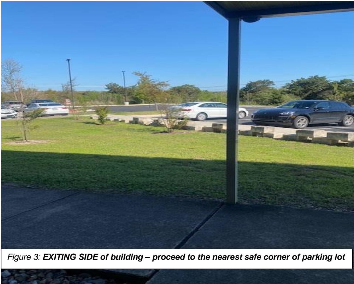
Figure 3: EXITING SIDE of building – proceed to the nearest safe corner of parking lot