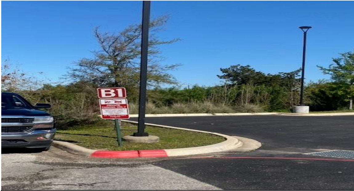
Figure 1: PRIMARY Safe Meeting Location – 8656 HWY 71 SW CORNER PARKING LOT (by the light pole)