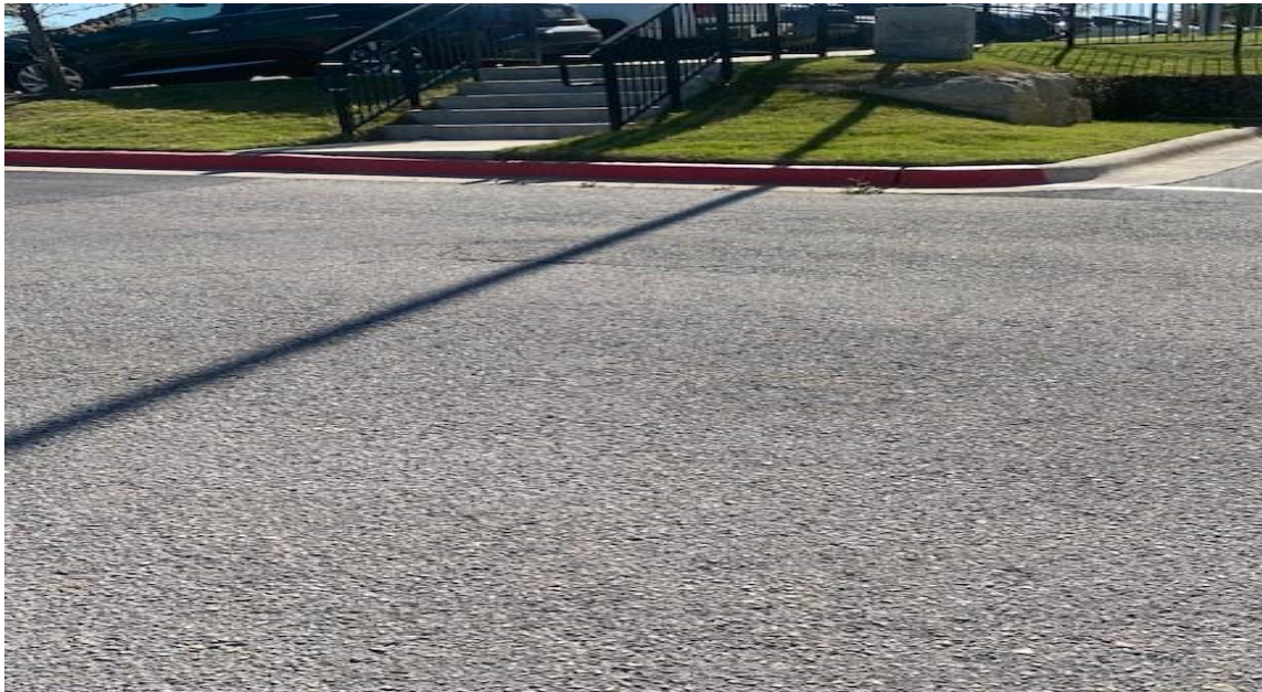
Figure 2: SECONDARY Safe Meeting Location – 8656 HWY NW CORNER PARKING LOT (by the stairs)