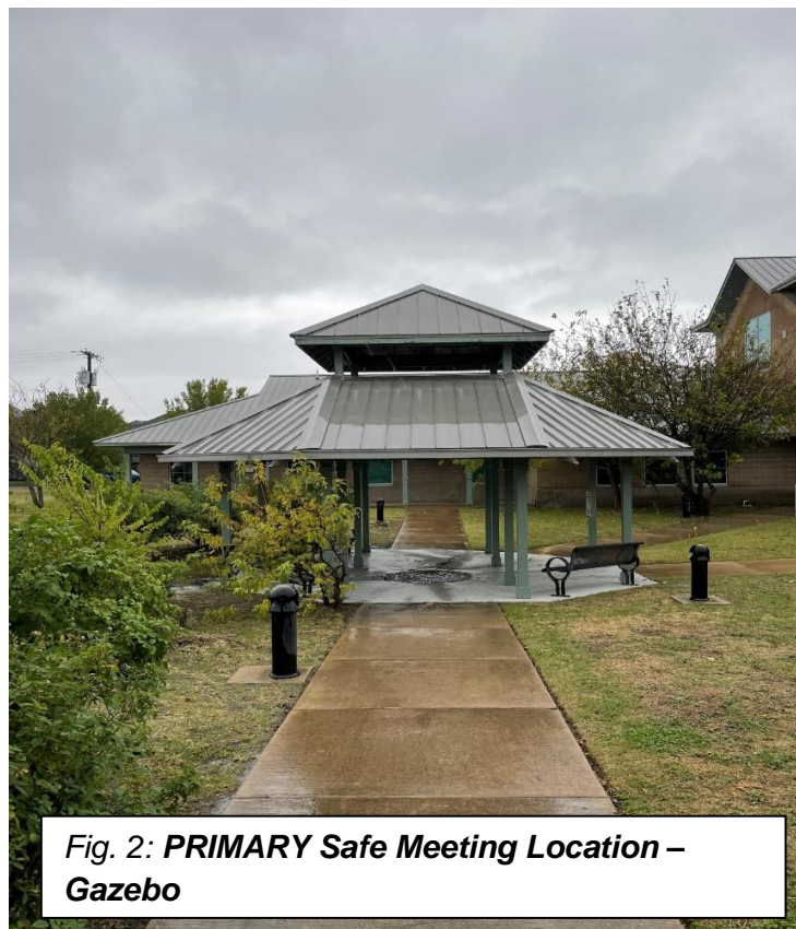
Fig. 2: PRIMARY Safe Meeting Location – Gazebo