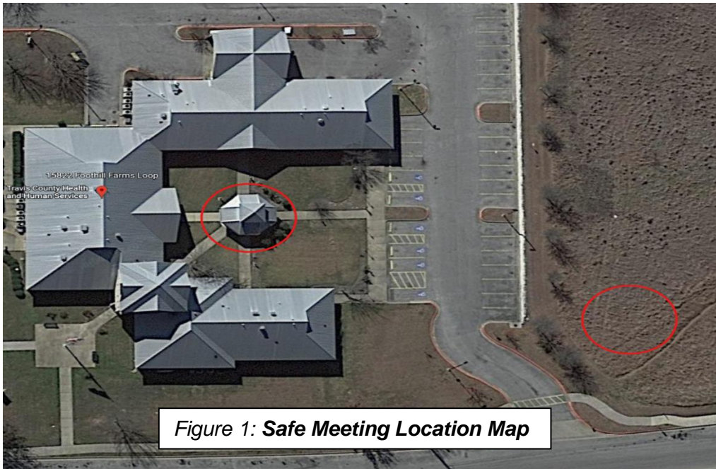
Figure 1: Safe Meeting Location Map