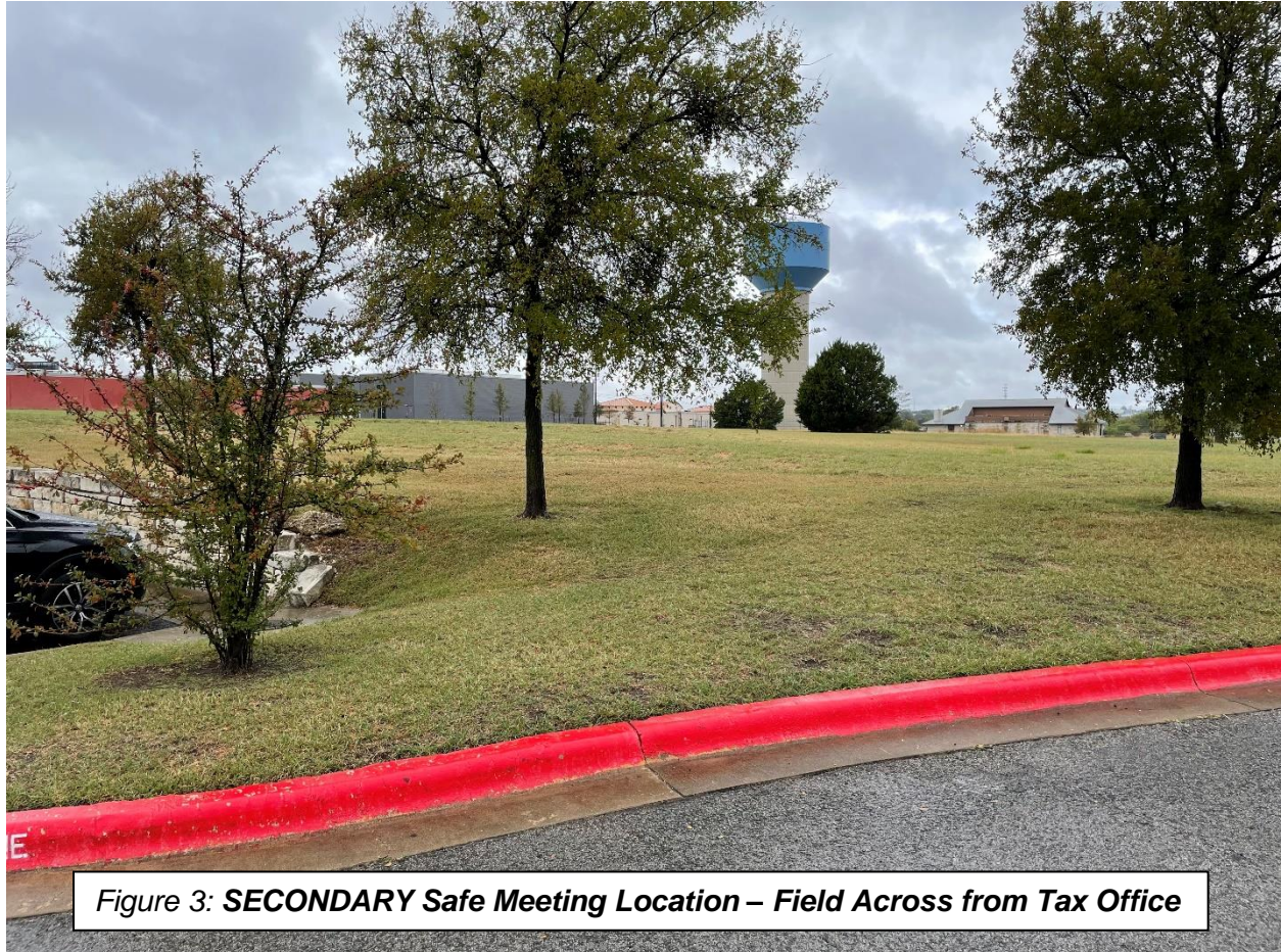
Figure 3: SECONDARY Safe Meeting Location – Field Across from Tax Office