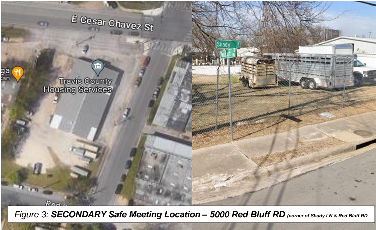
Figure 3: SECONDARY Safe Meeting Location – 5000 Red Bluff RD (corner of Shady LN & Red Bluff RD)