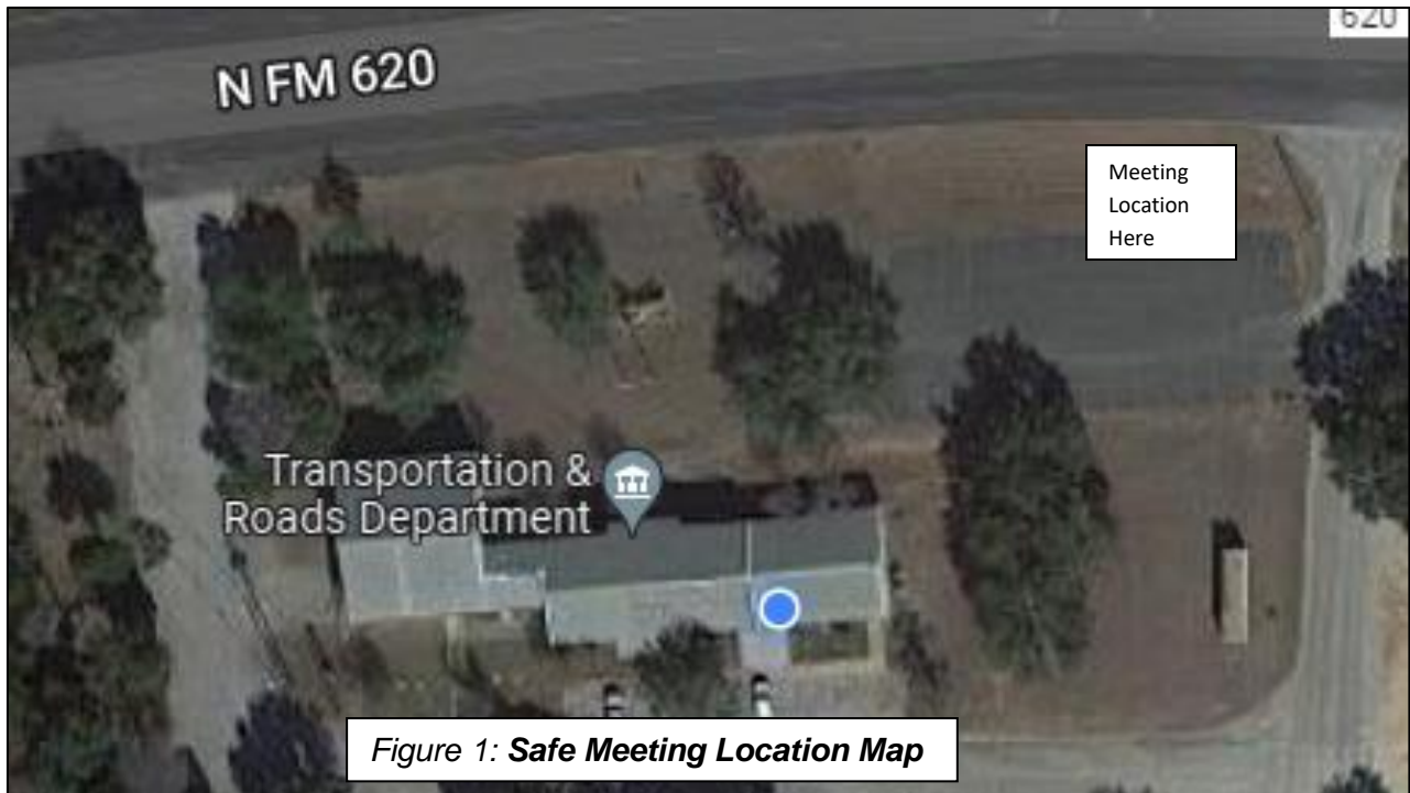
Figure 1: Safe Meeting Location Map