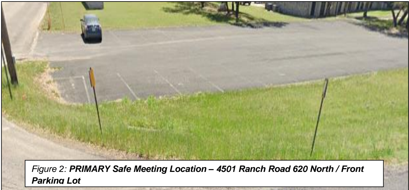
Figure 2: PRIMARY Safe Meeting Location – 4501 Ranch Road 620 North / Front Parking Lot