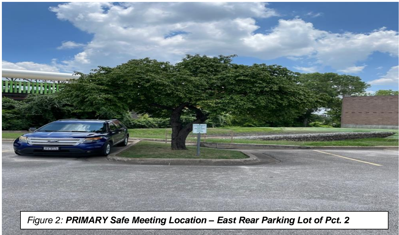
Figure 2: PRIMARY Safe Meeting Location – East Rear Parking Lot of Pct. 2