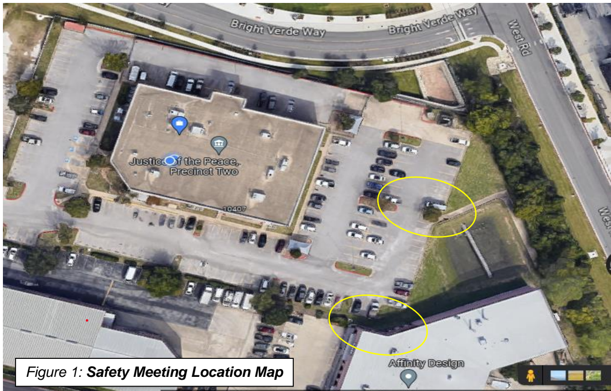
Figure 1: Safety Meeting Location Map