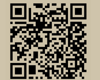
Conserve Travis Central Webpage

Contact us for any other items you might have questions about that are not listed in this pamphlet!